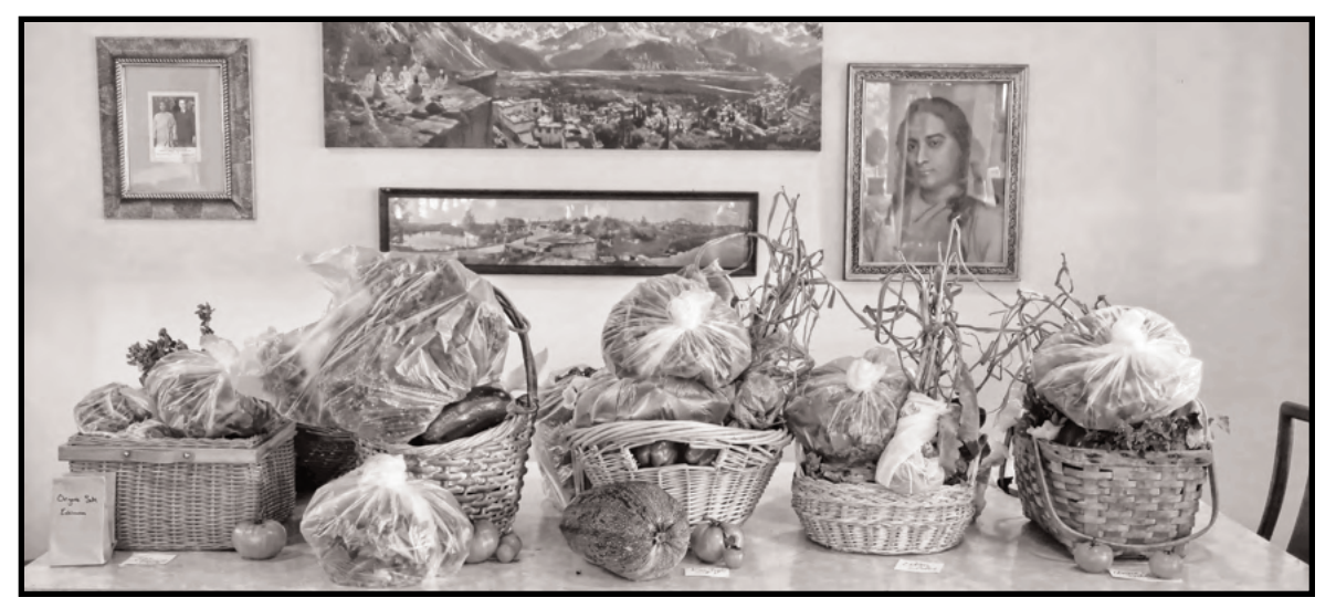
A cornucopia of veggies from the Retreat garden.