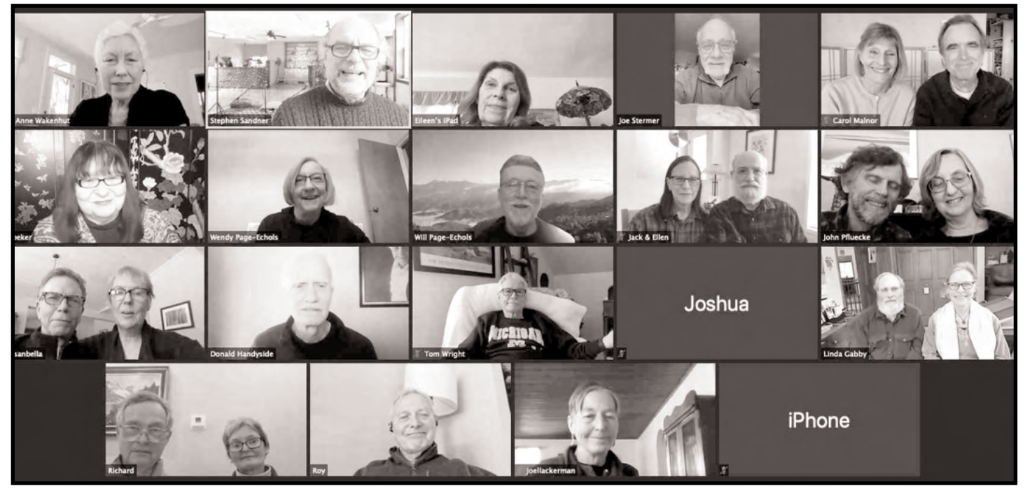
From California, Texas, Arizona, Milwaukee, and Michigan. Community members plan their future together in the spiritual atmosphere of Song of the Morning Ranch.